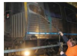
TRANSGEL is used for removing old, thicker, baked on graffiti from trains.