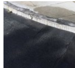
Ideal for removing spray can from asphalt / bitumen without damage.